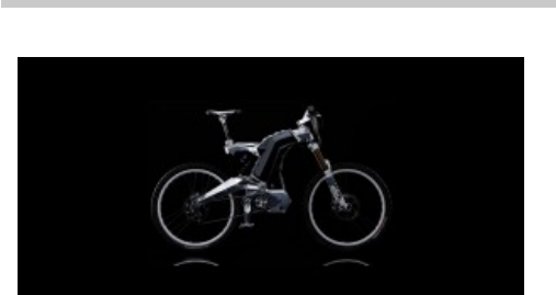
The New M-55 Beast Electric Bike