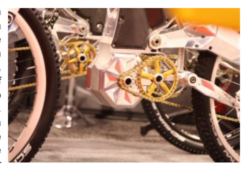
Close Up on the M-55 Beast

Additional models to accompany the original M55 design are soon to roll out. The M55 Beast, the flagship model, is now undergoing a revision to conform to street legalities in a version called the Daemon, whose official debut will be at the Top Marques 2011 in Monaco. A third M55 model, based on the essence of the Beast, utilizing a hydro-formed frame design to the same standards of strength but with less material and a lighter weight, is expected to roll out in the summer of 2011, and will be called the Shadow. These bikes will not be mass produced at any point. Even though the Daemon and the Shadow will be significantly less expensive than the Beast, the M55 brand aims to preserve the hand-made nature of production with limited series of 200 units per year for these model. They will always boast something unique, and will remain exclusive and mostly pre-ordered.